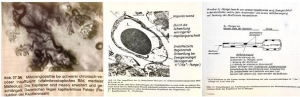
Figure 1: Oxygen therapy for varicose veins: swelling of the capillary walls and deformation due to high venous pressure (left picture), swelling due to insufficient oxygen partial pressure (picture middle and right).

The restoration of the varicose veins initially leads to a significant reduction in venous pressure in the entire venous tract up to the capillaries. The accompanying oxygen therapy generates a significant increase in the oxygen partial pressure with improved oxygen saturation the cells and thus also leads to a swelling of the microcirculatory vessels.