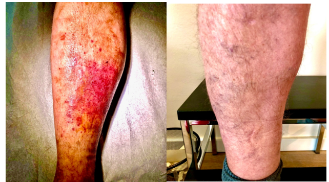
Figure 3: Oxygen Multistep therapy for varicose veins: Clinical picture of a patient with multiple ulcers - after VenaSeal® therapy and then after a series of 3 weeks regular combination of massage therapy and oxygen multi-step therapy healing of ulcers.

The clinical and sonographic examinations we have done at the first day, 14 days, 4 weeks and 3 months after therapy with the vein glue and micro-foam (Figure 3).