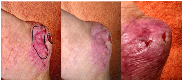
Figure 4: Oxygen multistep therapy for varicose veins: Clinical picture of a patient with multiple ulcers - after VenaSeal® therapy and then in a series of 3 weeks of regular combination of massage therapy and oxygen multi-step therapy.